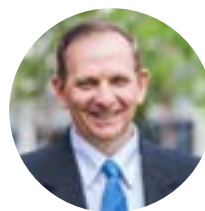
MAYOR TONY WILLIAMS